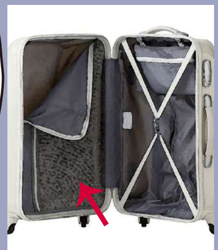
• For partition plates for suitcase