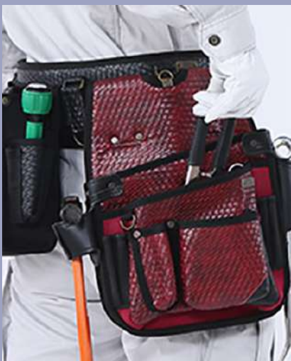
• Bag interlining