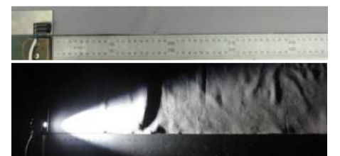
White LED Result of measurement