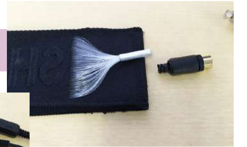
【LED source installation】