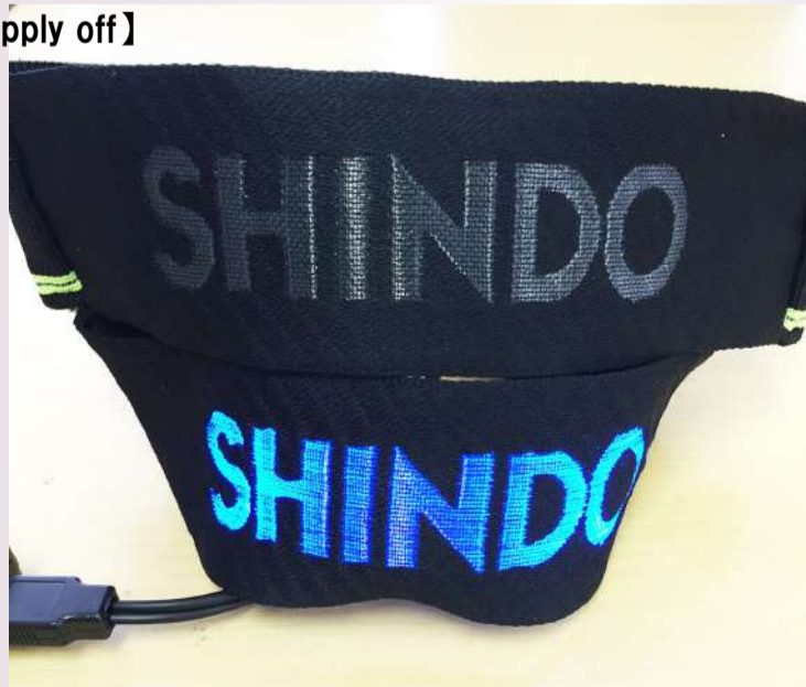
【Power supply off】