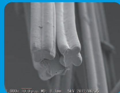
Thread cross section electron micrograph

Silver ions exerted from fibers with effect of antibacterial and anti-odor is directly kneaded into the yarn with cross-section structure.